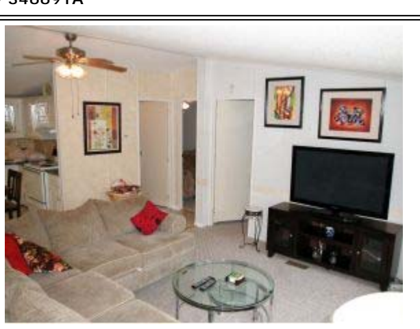
Open Floor Plan