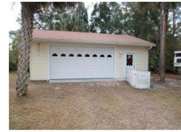
2 Car Expanded Garage