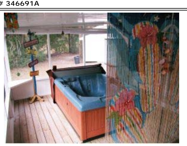
Lanai with Hot Tub