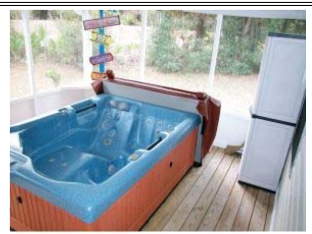
Hot Tub - Too much fun!