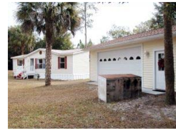
Enormous Detached Garage