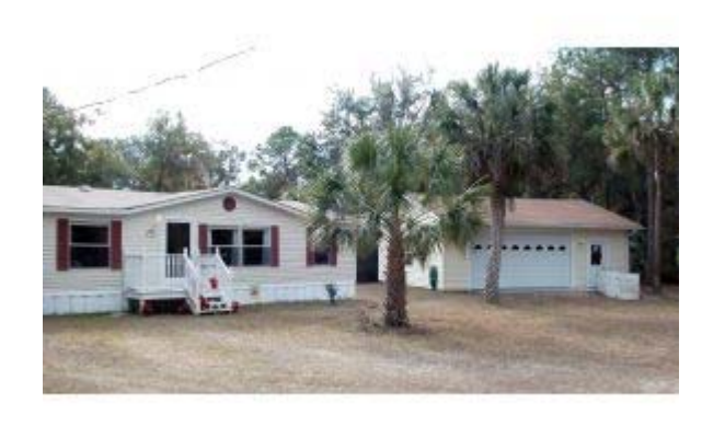
Perfect Condition - New Roof