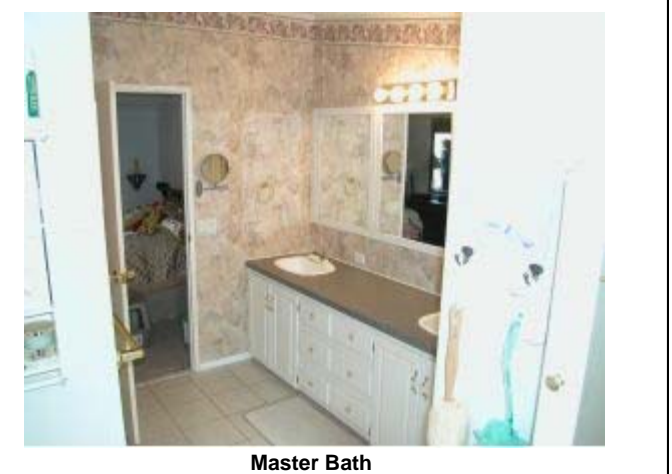
- - - - Information herein deemed reliable but not guaranteed - - - -REALTORS ® Association of Citrus County, Inc. 07/21/2011 08:29 AM