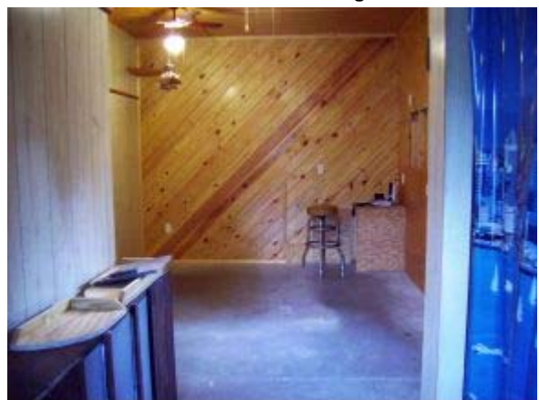
Office Area in Detached Garage