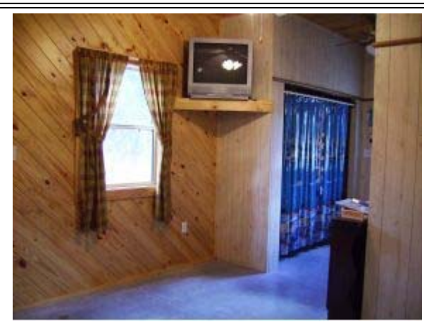
Office Area in Detached Garage