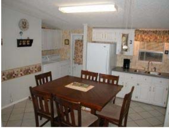
Eat In Kitchen