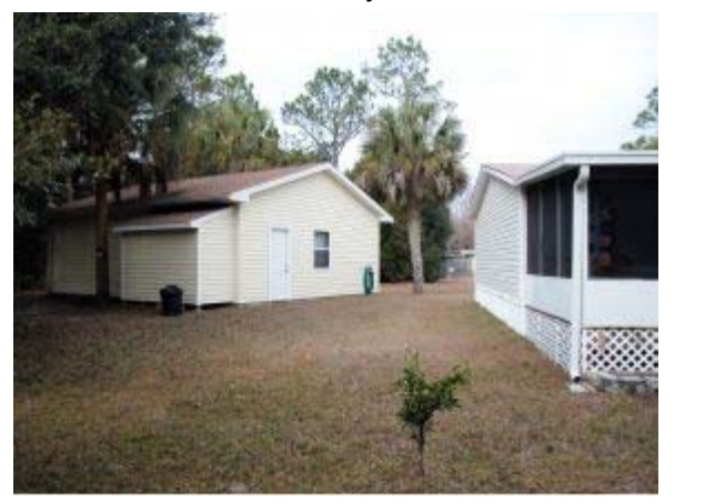
Garage with Bump-out

- - - Information herein deemed reliable but not guaranteed - - - -REALTORS ® Association of Citrus County, Inc. 07/21/2011 08:29 AM