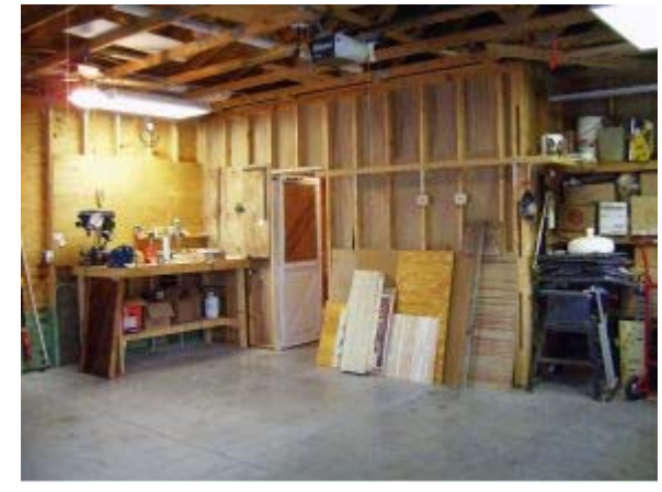
Detached Garage and Workshop