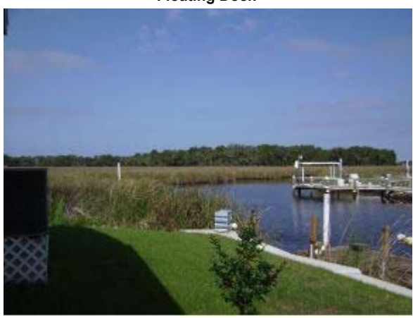
Minutes to Gulf of Mexico