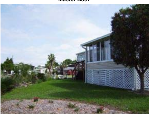
Lush Tropical Landscaping