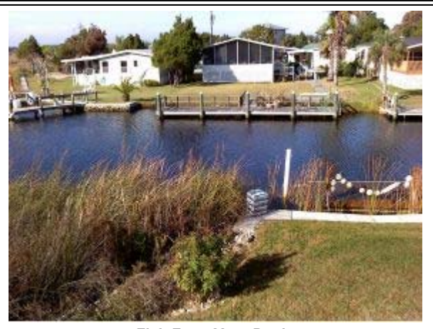
Fish From Your Dock