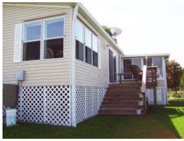
Deck and Sun Room