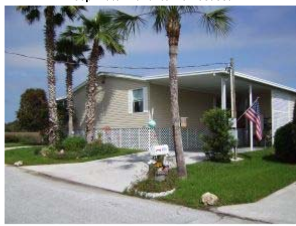
Homes of Merit Top of the Line