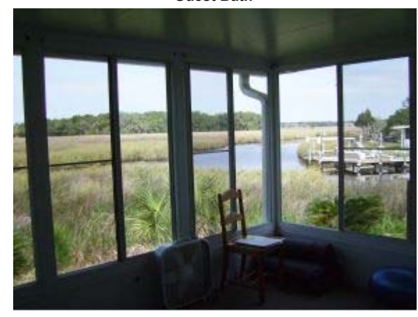
Sun Room overlooking Water