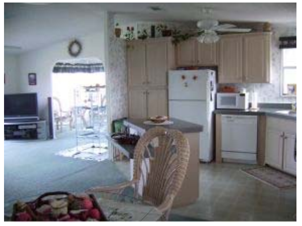
Light Bright and Open