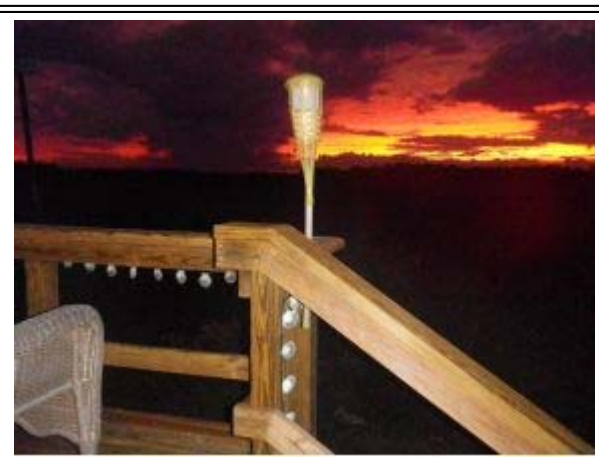
Fire up the Tiki!

- - - - Information herein deemed reliable but not guaranteed - - - - REALTORS ® Association of Citrus County, Inc. 04/13/2012 10:43 AM