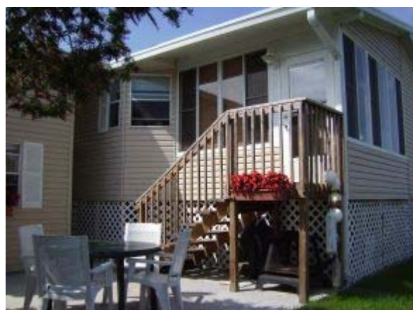
Patio overlooking the Water