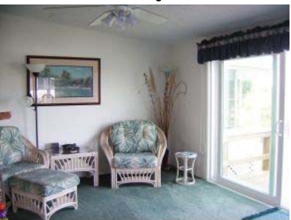
Living Room to Deck