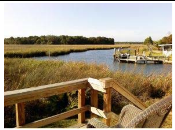
Deep Water Canal to Homosassa