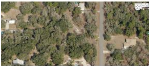
Paved Roads in Crystal Manor