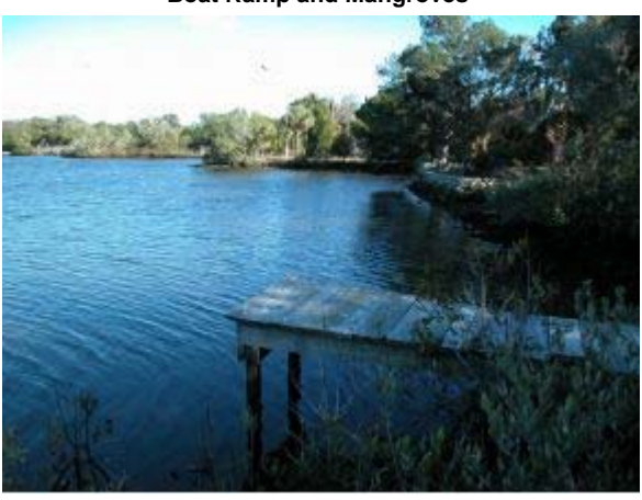
Tranquil and relaxing