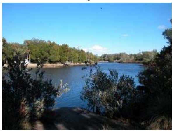
Boat Ramp and Mangroves