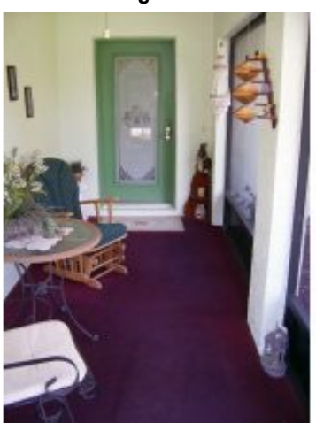
Screened Entry Porch