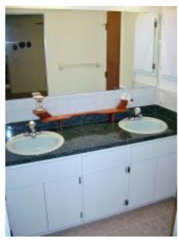
Master Bath Dual Vanaties

- - - - Information herein deemed reliable but not guaranteed - - - - REALTORS ® Association of Citrus County, Inc. 10/25/2012 10:36 AM