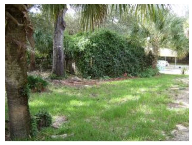
Country Setting on 1.16 Acres