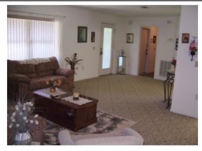
Entry & Living. Room