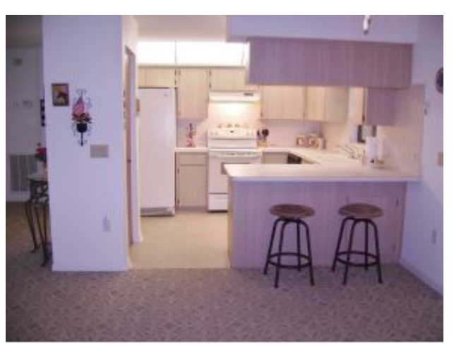
Kitchen with Breakfast Bar