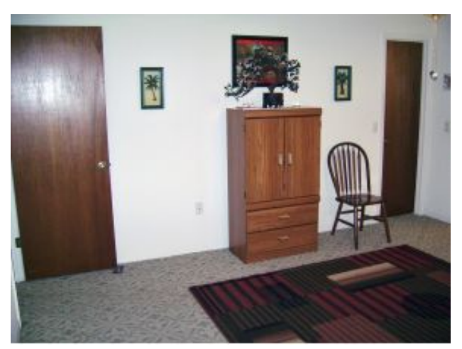
His & Hers Walk In Closets