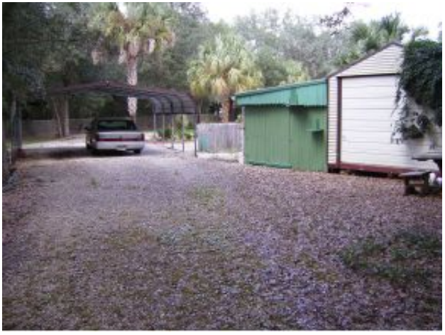
Utility Shed Wkshop & Carport