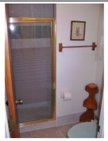
Master Bath Water Closet