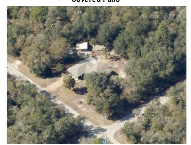
Corner Lot, Private Setting