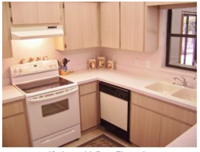
Kitchen with Pass Through