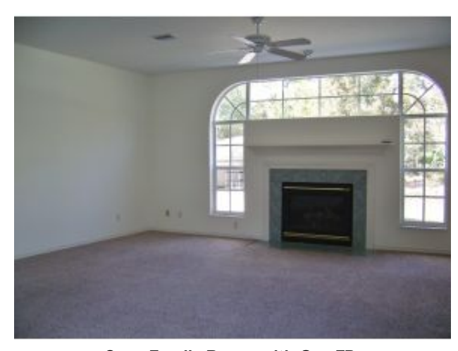
Cozy Family Room with Gas FP