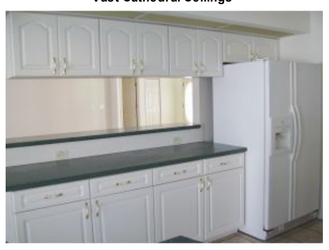
Corian and lots of Cabinets