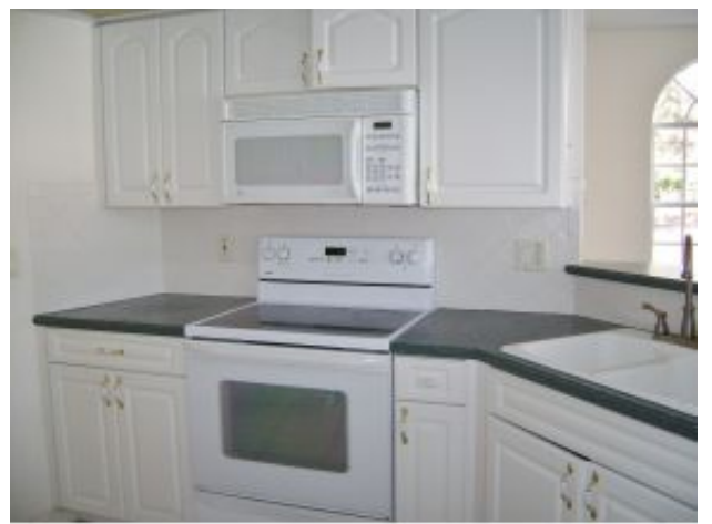
Kitchen open to Family Room