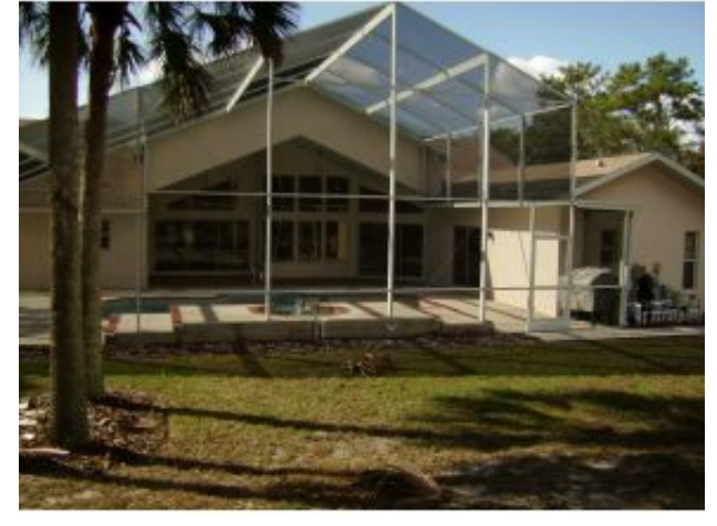
Private 5+ Acres