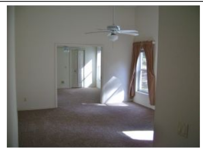
Master Bedroom & Connecting BR