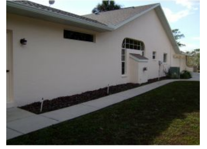
3 Car attached Garage