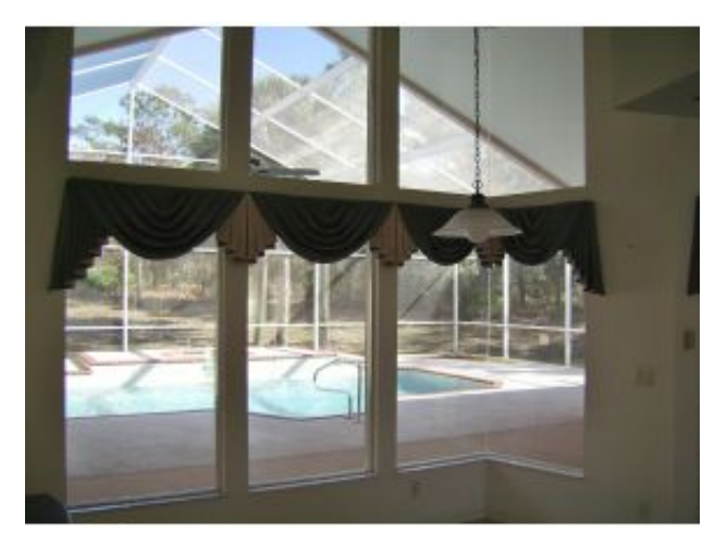
Fabulous Pool views all around