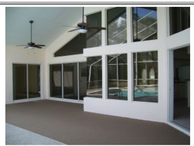
All eyes on the Pool