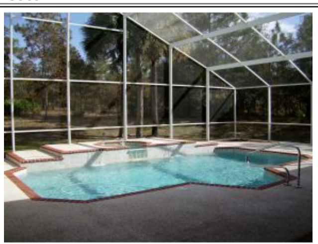
Sparkling and Inviting