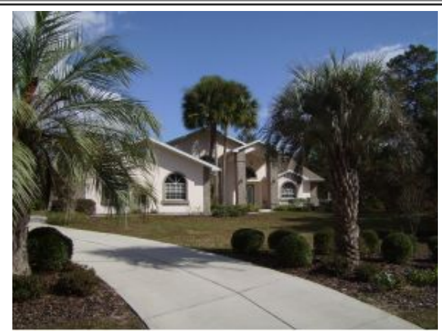
When only the best will do!