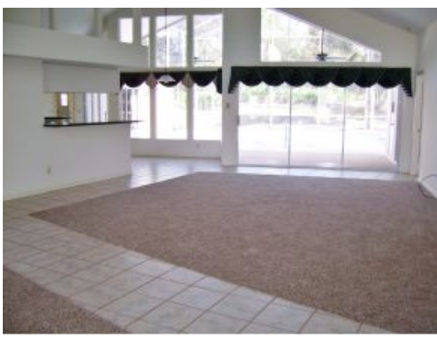
Vast Cathedral Ceilings