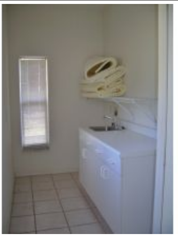
Master Suite Laundry