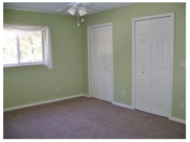
3rd Bedroom & spacious Closets