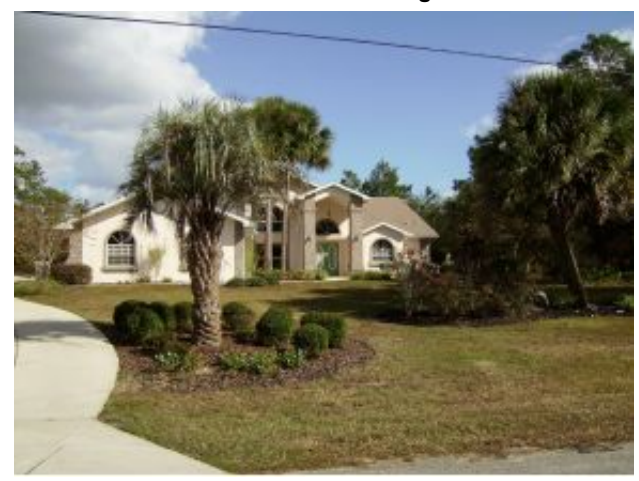
Welcome Home Lucky Buyer

- - - - Information herein deemed reliable but not guaranteed - - - - REALTORS ® Association of Citrus County, Inc. 11/15/2012 02:43 PM