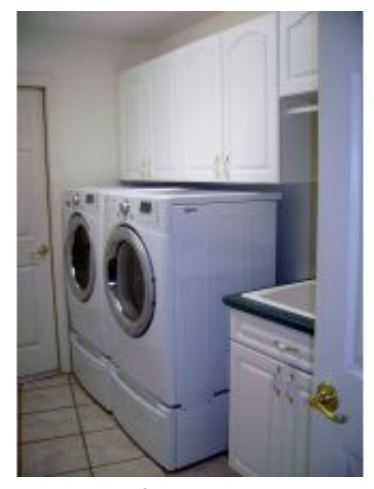
Washer & Dryer included