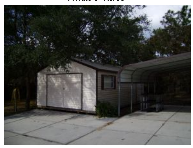
Workshop and Carport too!