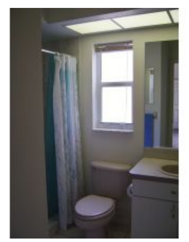
Bath in Bedroom Suite